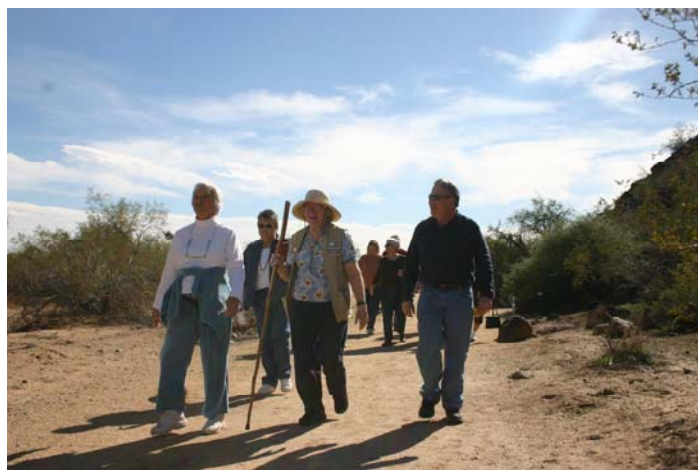
DVRAC Guided Tour

Saturdays in January, 10 - 11 am, DVRAC, Guided Tours: Special guided tours of the petroglyph trail, nature preserve and museum. Tour is included with regular admission.