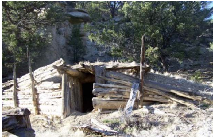
An elaborate dugout at the Savage Homestead in Cebolla Creek, El Malpais NCA